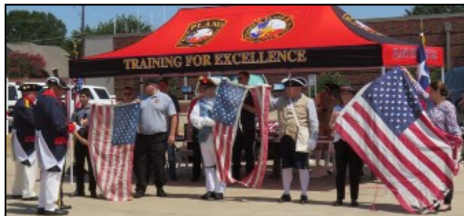
Explorer Cadets, SAR color guard and DAR members holding tattered flags for inspection.