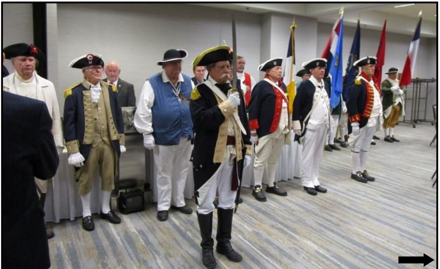
Bottom picture: The Color Guard posting the colors at the beginning of the Friday evening dinner & meeting.