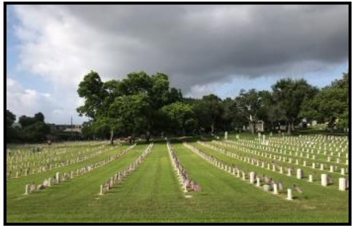
The Texas State Cemetery in Austin

“Memorial Day is not a day to represent the first day of summer. It’s a day to pay our respects to the many military service men [and women] that have made the ultimate sacrifice for our country’s freedom and liberty.”