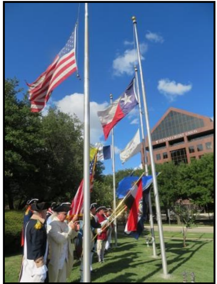
On Friday afternoon, the flags flying at the Hilton Hotel were momentarily lowered to half-staff by the Color Guard, at the request of the President of the United States, while the Color Guard stood in honor of the 13 service members recently killed in Afghanistan.