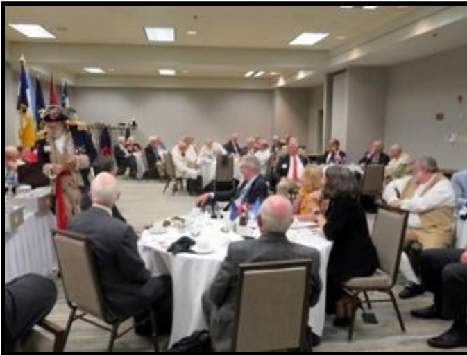
Friday night's dinner & program