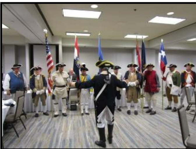
The Color Guard rehearses Posting the Colors for the Opening Friday Dinner & Meeting.