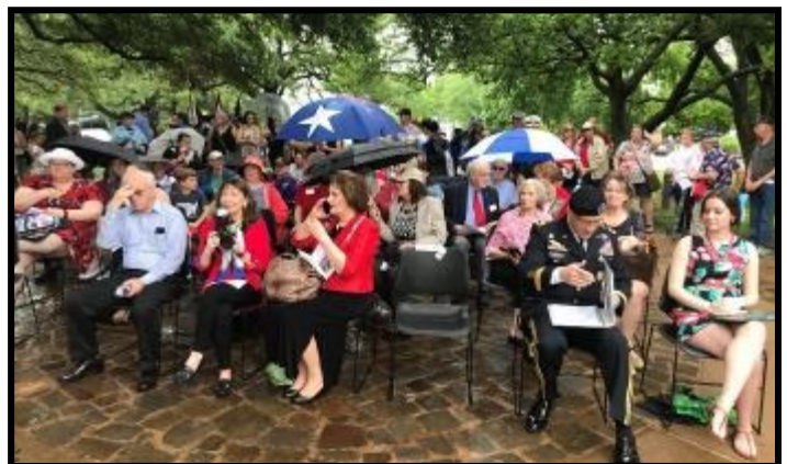
Part of the large crowd gathered for Memorial Day