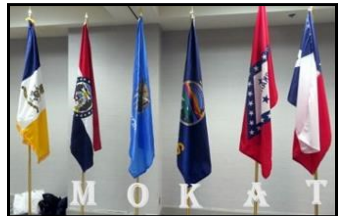
The state flags for each of the societies in the South Central District - Missouri, Oklahoma, Kansas, Arkansas, Texas, plus the SAR flag.