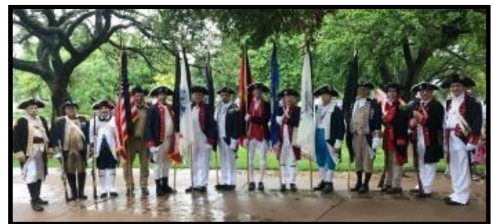
The Texas Society Color Guard