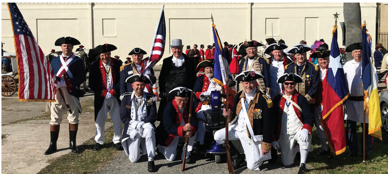
Members of Bernardo de Galvez Chapter and statewide guests participated in the traditional Galveston “Dickens on the Strand” holiday extravaganza.