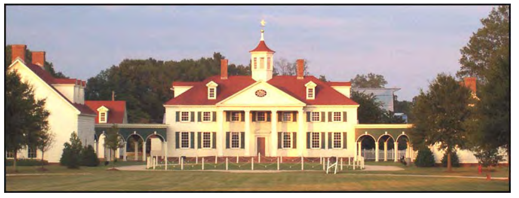
Visitors to American Village are greeted by this replica of Mount Vernon

Founded in 1999, the American Village serves the Nation as an educational institution whose mission is to strengthen and renew the foundations of American liberty and self-government by engaging and inspiring citizens, leaders and stewards.