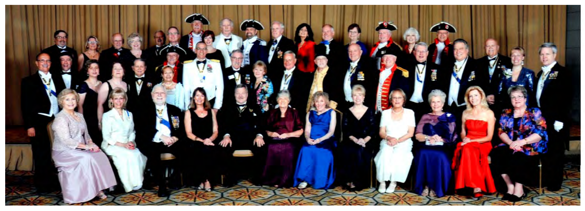
The Texas Delegation and their Ladies at the 122nd Annual SAR Congress in Phoenix