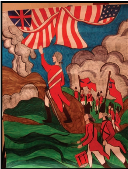
One of the winning posters from this years contest.