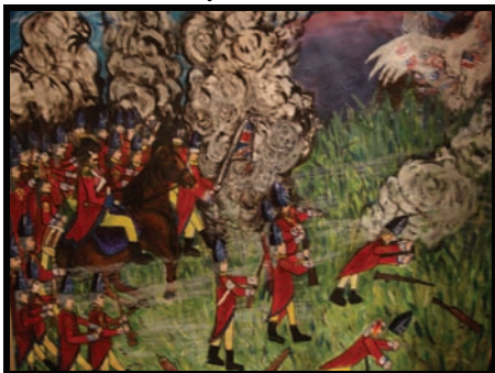
Poster Contest Entry

Non-Profit U. S. Postage PAID Temple, Texas Permit No. 136