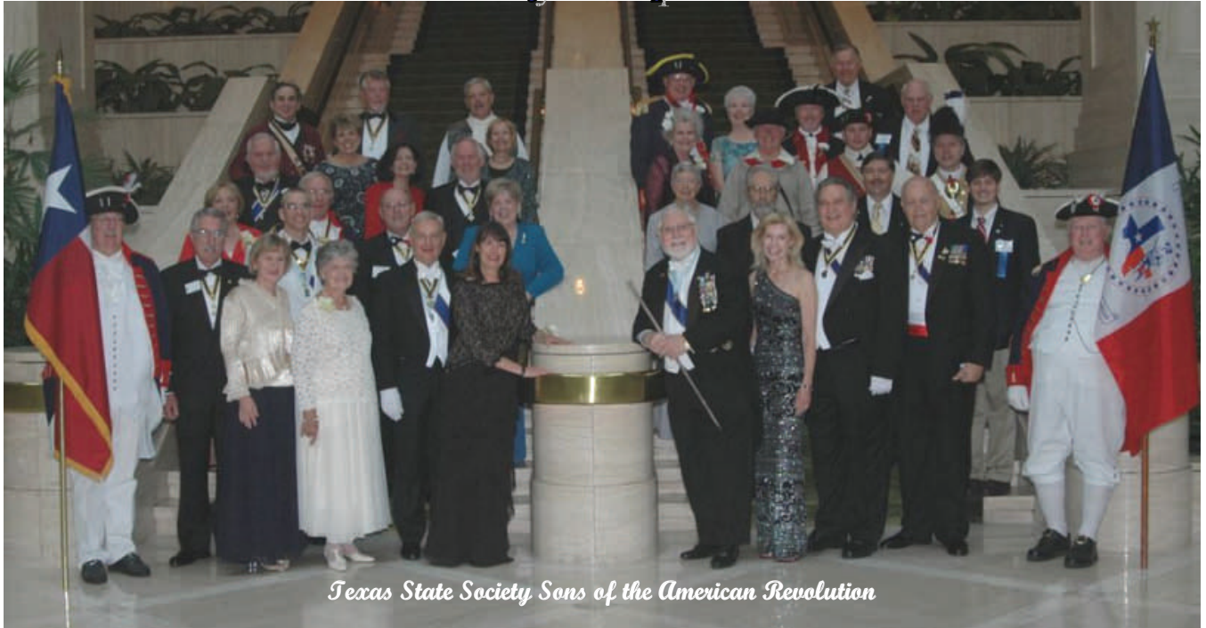
Texas State Society Sons of the American Revolution