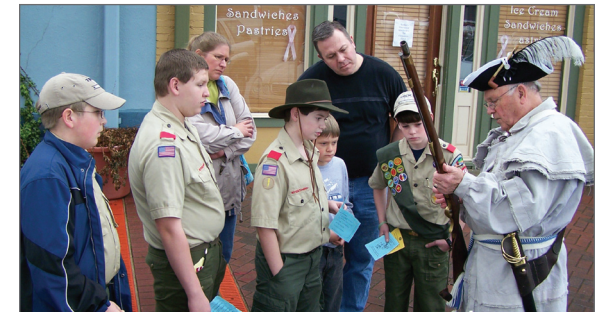
Scouts observing musket demonstration during Washington, Georgia, ceremonies.

The SAR and the Boy Scouts participate in many activities together. Scouts of all ages can help during SAR parades and ceremonies including grave markings and Revolutionary War battle ceremonies. SAR members contribute to Scouting activities by teaching relevant merit badges, such as American Heritage, Genealogy, Law, Citizenship in the Community, Citizenship in the Nation, and Citizenship in the World.