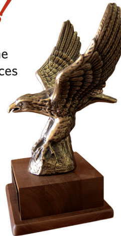
State Winner Trophy

LIST OF STATE CHAIRS, ANCESTRY CHARTS, COMPLETE RULES AND ALL FORMS CAN BE FOUND AT WWW.SAR.ORG