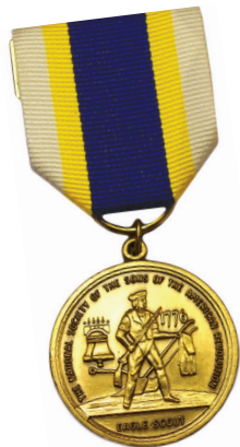
Chapter Winner Medal

Original patriotic theme of not more than 500 words