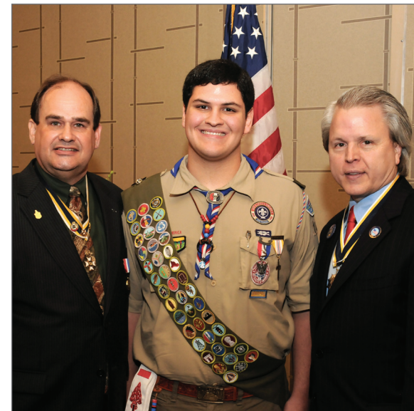
2014 SAR Eagle Scout Scholarship Winner