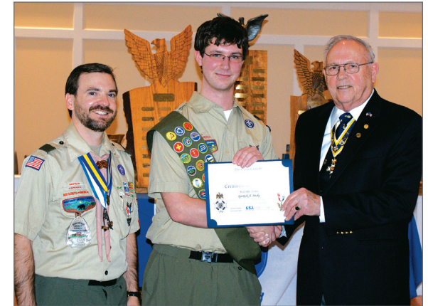
Eagle Scout Court of Honor recognition by the Sons of the American Revolution.

The SAR and the Boy Scouts participate in many activities together. Scouts of all ages can help during SAR parades and ceremonies including grave markings and Revolutionary War battle ceremonies. SAR members contribute to Scouting activities by teaching relevant merit badges, such as American Heritage, Genealogy, Law, Citizenship in the Community, Citizenship in the Nation, and Citizenship in the World.