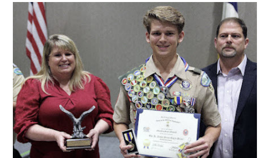
Eagle Scout - 2022 National Winner