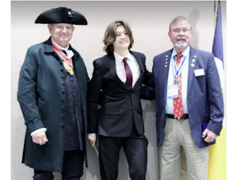
Oration - 2022