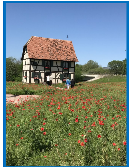
Steinback Haus, an Alsatian house, originally built between 1618 and 1648 that was relocated to Castroville, Texas.