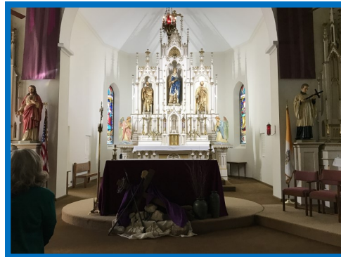
Present day St. Louis Church