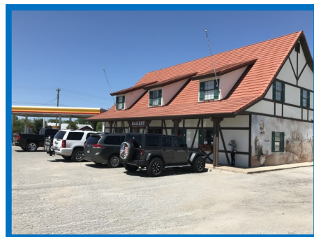
Haby's Alsatian Bakery in Castroville, Texas