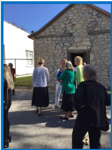
First St. Louis Church dedicated 1846