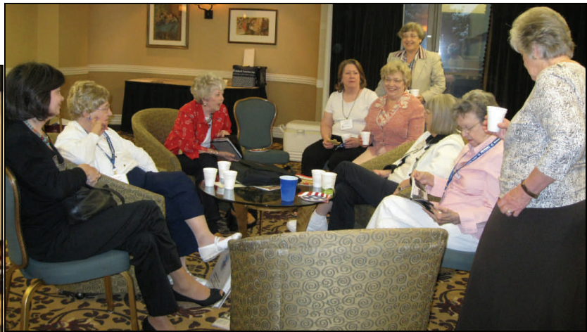
Pictured above: Sitting around waiting for the men's meeting to end.

It is a time to share photos of vacations, grandchildren and generally catch up.