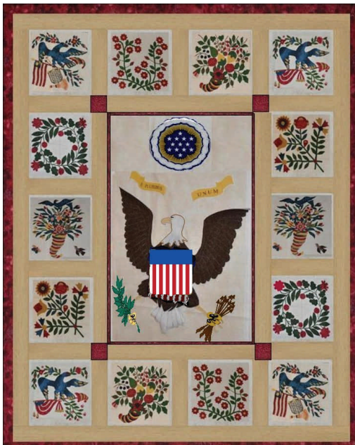
Overall size 67" x 80"