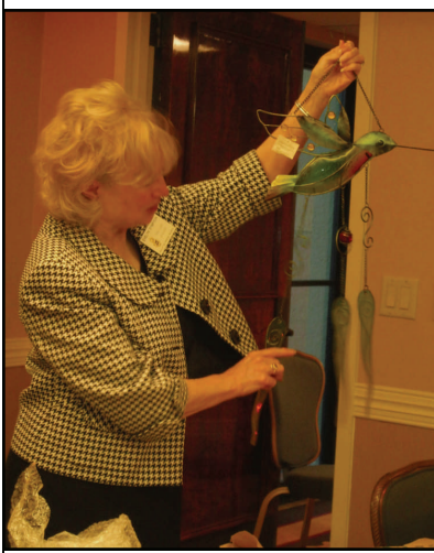
a hummingbird wind chime for her patio. (see photo above)