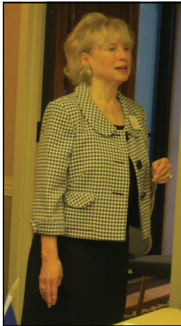
First Lady Evelyn Sympson discusses activities at the national level.